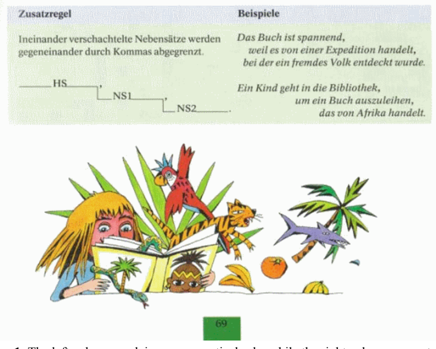
Figure 1: The left column explains a grammatical rule, while the right column presents example sentences: "Examples: The exciting book is about an expedition during which strange people were discovered. A child goes to the library to borrow a book about Africa." Deutschbuch, Cornelsen 2001, p. 69